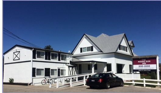
The Rising Sun Inn

Our company is well managed and supervised by professional, caring men and women whom are compassionate about helping people in recovery. The foundation of our program is based on the Big Book of Alcoholics Anonymous . Rising Sun is not a faith based program, but a spiritual program that encourages